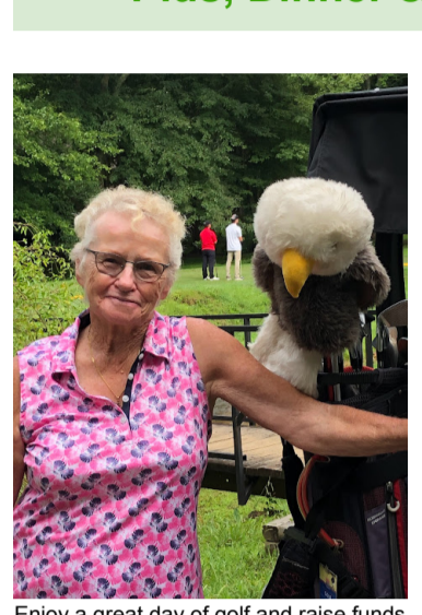
Enjoy a great day of golf and raise funds for Hinton's community outreach!

Golfers and sponsors, register now to participate in and support our third annual "Swing for Hinton, Swing for Hope" Charity Golf Tournament, Saturday, August 19, at the scenic Mountain Harbour Golf Club in Hayesville, NC. This best-ball format starts at 9am. Golfers can arrive early for a snack breakfast, coffee from BSG Coffee & Cafe, putting practice, and to buy mulligans and raffle tickets. Lunch, included in the registration fee, will be served by the Mountain Harbour Grill. You also get a swag bag filled with bottled water, snacks and fruit, and coupons and treats from local businesses. Signs at each hole identify our generous sponsors and highlight the many ways Hinton serves and supports our area. This year there will also be a Dinner & Silent Auction on Friday, August 18, at 6pm. For more information on the golf tourney, to register as a player, team, and/or sponsor, and for dinner details and reservations, please visit www.hintoncenter.org/charity .