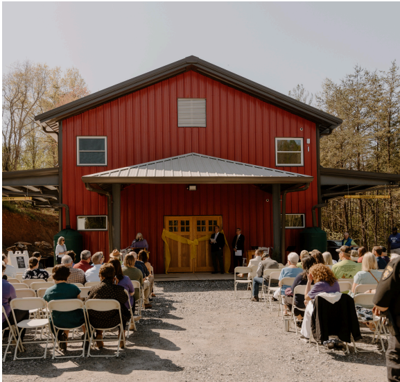
Educational Tool Barn Dedication 4/15/24